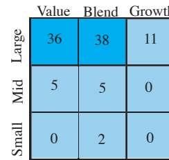
Style Box breakdown